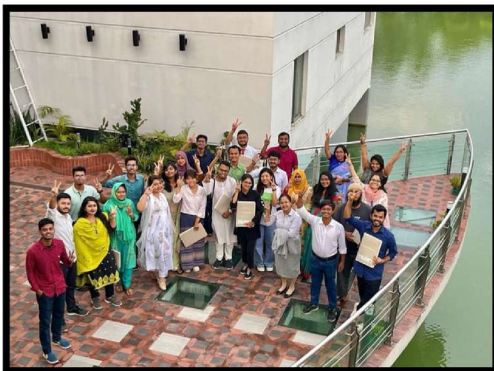
Youth Residential Workshop, 2023, with the Youth Fellows and CAP-RES team