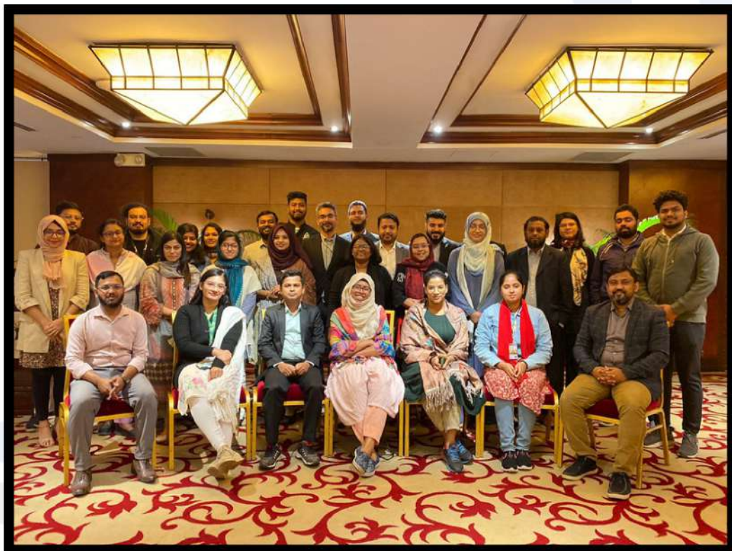
At the end of the post-COP28 training on, “Navigating COP28: Strategies for Effective Climate Advocacy and Action”