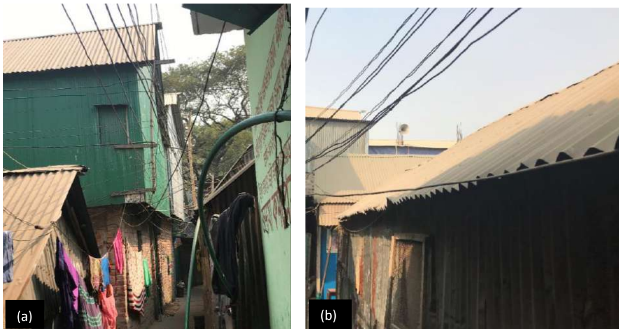
Figure 2: Housing status in the Ershadnagar community; (a) corrugated tins used for roofing and Bricks used for walling purpose and (b) Tin-thatched line houses (Field work, 2022)

The housing condition of the Ershadnagar community is mostly similar to that of Korail housing. Mostly the houses are tin-thatched roof with brick walls. Line houses either detached or semi-detached are also present here (see Figure 2). These housing materials like tins, bricks are susceptible to firing. Presence of single front door and no windows elsewhere makes the houses uninsulated, dark and extremely hot during summer season.