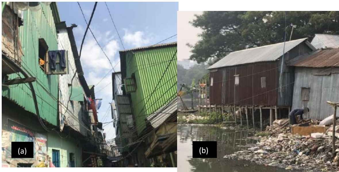
Figure 2: The housing structure in the Korail community; (a) tin-shed housing and (b) stilt housing (Fieldwork, 2022).

Majority of the people in Korail community reside in tin-shed housing on a temporary basis (see Figure 2); handful portion of them live in a manufactured/semi-manufactured houses with permanent walls and brick/cement made roofs [3]. Households which are near the water's edge has built their house on stilts using bamboos (see Figure 2). The floor of the stilt house is adjustable depending on the flood level [1].