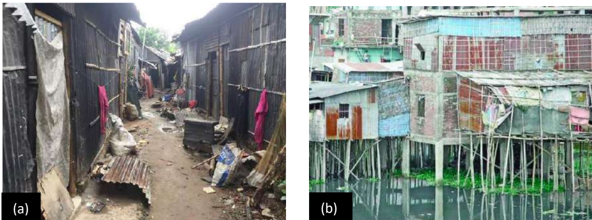
Figure 2: Housing status in the KPB community; (a) corrugated tins used for roofing and walling purpose [1] and (b) bamboo frames used for stilt housing [4]

The housing condition of KPB community is extremely fragile, made of on bamboo frame with reused corrugated tin roofing and walling (see Figure 2). Most houses consist of a single room of about 9 sq. m., accommodating on average a four-person family which represents the typical dwelling scenario of other informal settlements in Dhaka which is 7-9 sq. m. Presence of only single front door and no windows elsewhere makes the houses awfully hot during summer season. Also, lack of ventilation to release smokes produced from cooking stoves makes the houses exacerbate the heat [1].