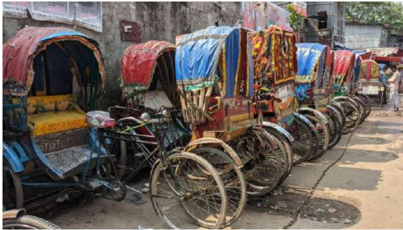
Figure 3: Three-wheeled rickshaw vehicle to serve livelihood purpose.

The Chalantika inhabitants mainly work as garments workers, rickshaw (three-wheeler vehicle) (see Figure 3). or three wheeler goods carrying pullers, day-laborers, brickcrushers, construction workers, cleaners and domestic helpers.