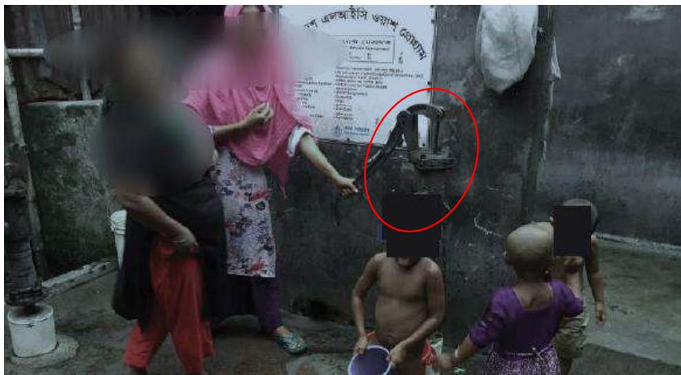
Figure 3: Shared communal water point at the KPB community [1].

Sources of drinking water for most of the households are tubewell (see Figure 3), piped water and public tap; these are also common sources to water for cooking and other purposes. The services are mostly provided by NGO/CBO (e.g., DSK) or are public utility (mostly public taps). Most of the households pay a flat rate each month costing around $2-$4. Water is almost always available in the sources with occasional disruptions (Field work, 2022).