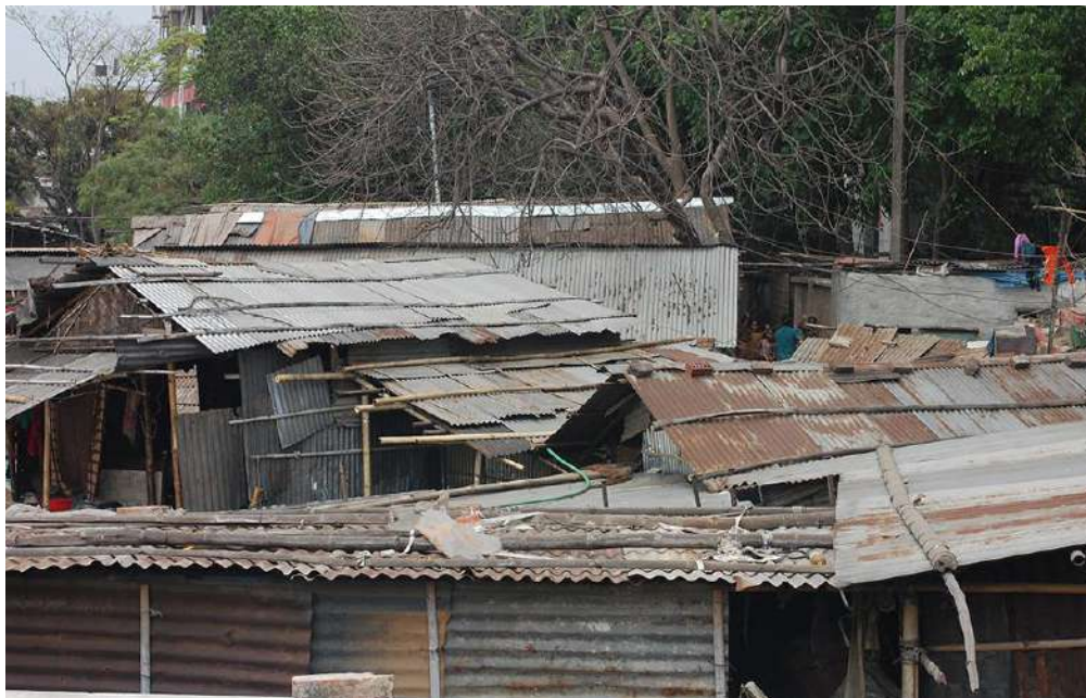
Figure 2: Housing status at the Chalantika community; sheet metal and bamboo pole are used for roofing and walling purpose [1]

Most of the houses are line house, though detached or semi-detached houses are also visible. The houses are either self-built or rented. Majority of the households do not have any documents for the houses as well. They are reluctant to store documents regarding housing as they are lacking with land ownership where they have been living. The housing condition of the Chalantika community is extremely precarious, made of sheet metal and bamboo pole (see Figure 2). Typically, a family of 4-5 people use to live in a shack like settlement [1].