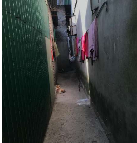
Figure 4: A narrow passage to exit and enter the house (Field work, 2022).

The roadway patterns are so disorganized and dense that a three-wheeled vehicle could hardly move through the road. The passage to exit from the house is so narrow that an ambulance could hardly enter to the household to carry a critically injured patient (see Figure 4). The working personals usually go and return home by foot. They also commute via CNG and bus whenever necessary. The monthly transportation costs $ 10-20 for transport purpose. Previously they commuted via boat trip to reach at their working destinations which is now closed by the city corporation authority.