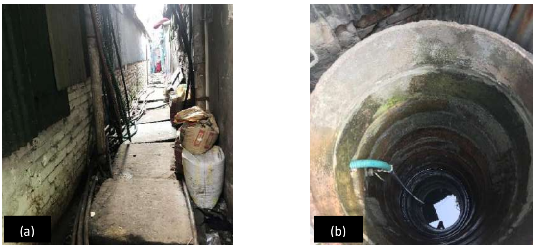
Figure 3: Status of the water service provisions in the Korail community; (a) the pipes lay over the ground to supply water and (b) piped water is stored in a water tank (Field work, 2022).

the residents were used to pay water bill through meter. However, with the passage of time the water mafias/ local politicians have taken control over the water flow and converted water commodity as a business. At present, every household is entitled to get water supply for 30 minutes to 1 hour a day maximum. Furthermore, there is no fixed timing regarding water's availability amidst 24-hour period. Surprisingly, water is readily available during late-night. However, the community receives 60% water supply from the DWASA/DSK pipe line system (see Figure 2) and 40% bought from outside of the area with a monthly payment [3]. Very few numbers of tube wells (see Figure 3) are available in this community. Lake water is also used to serve other purposes like cooking, cleaning by the a few numbers of people in this community [3].