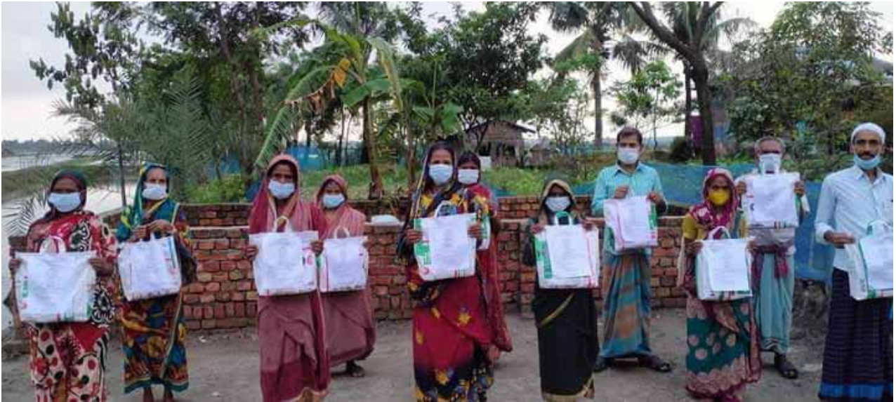
The Swapnorath organization extends a helping hand to the people affected by Covid-19 and Hurricane Yaas