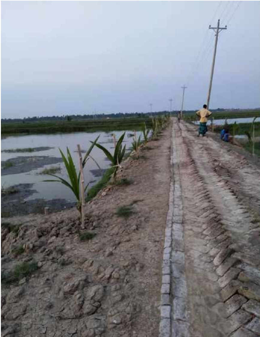
Tree planting program in the aftermath of Amphan cyclone