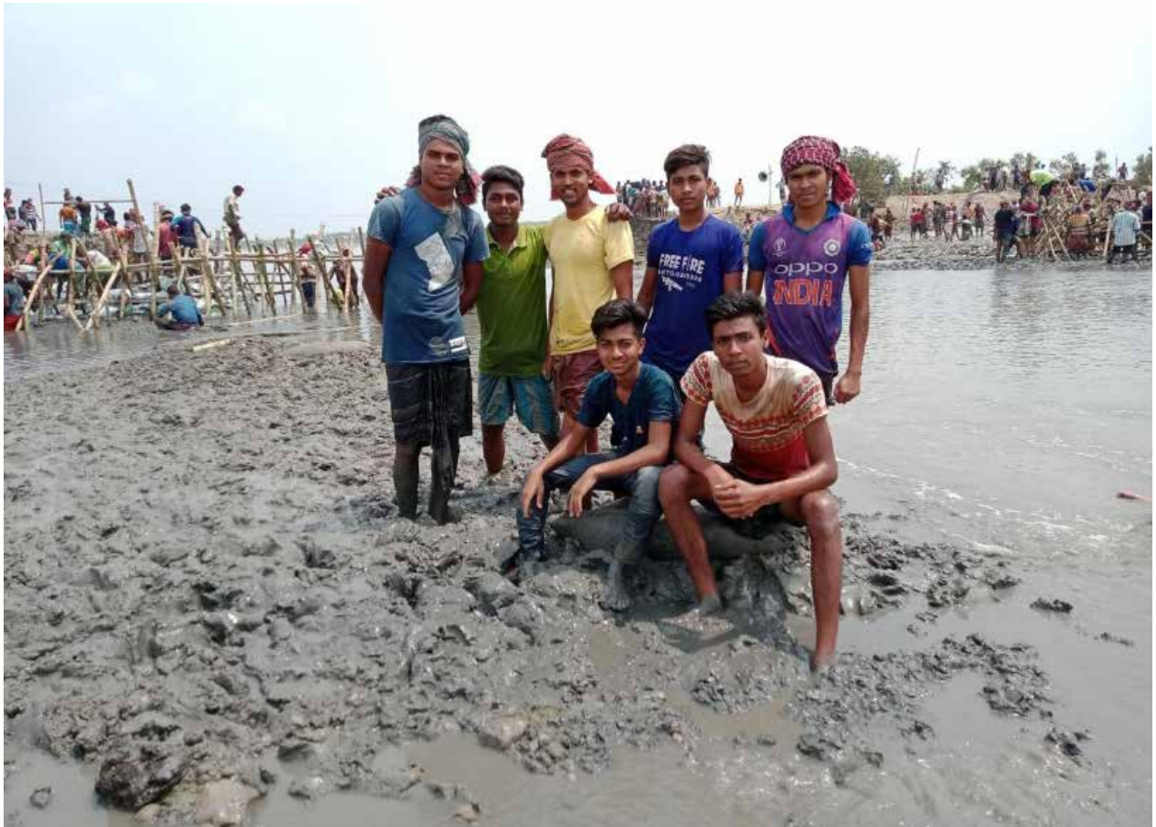
Swapnorath organization participating in the construction of river dams