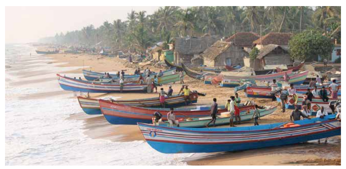
Fishermen at Valiathura beach are getting ready for their daily fish catch, while other community members enjoy the evening beauty of the beach. LANGSCAPE MAGAZINE

IN RECOGNITION OF THE IMPORTANCE OF NON-ECONOMIC LOSSES, NELD HAS BEEN INCLUDED IN THE WORK PLAN OF THE WARSAW INTERNATIONAL MECHANISM AS A SPECIFIC WORK AREA OF THE UNFCCC