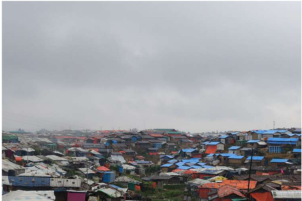
Fig. 1 Rohingya Camp (Kutupalong, Cox's Bazar, Bangladesh)

cyclones that originate in the Bay of Bengal. It is now apparent that even though the Rohingya could escape the ethnic violence in Myanmar, they are now facing various environmental hazards in Bangladesh. The sustainability challenges became more complicated and complex, since the entire refugee camp have exposed to the on-going global pandemic. Further details are as follows: