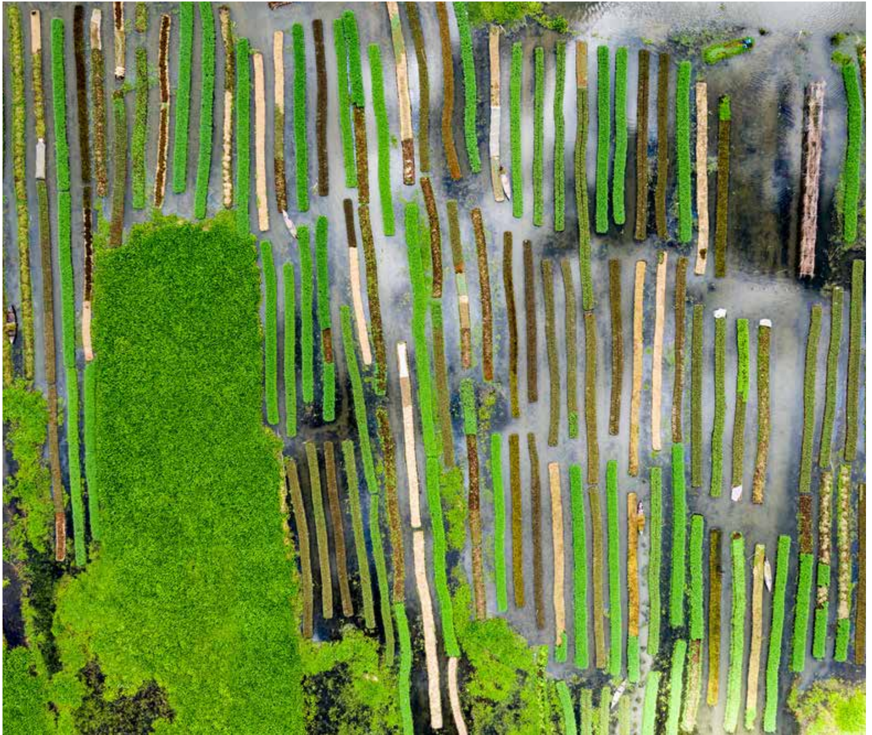
Bangladesh has been practicing local adaptation techniques for generations to adapt to climate change risks. This photo illustrates the long-practiced floating garden agriculture in Bangladesh.