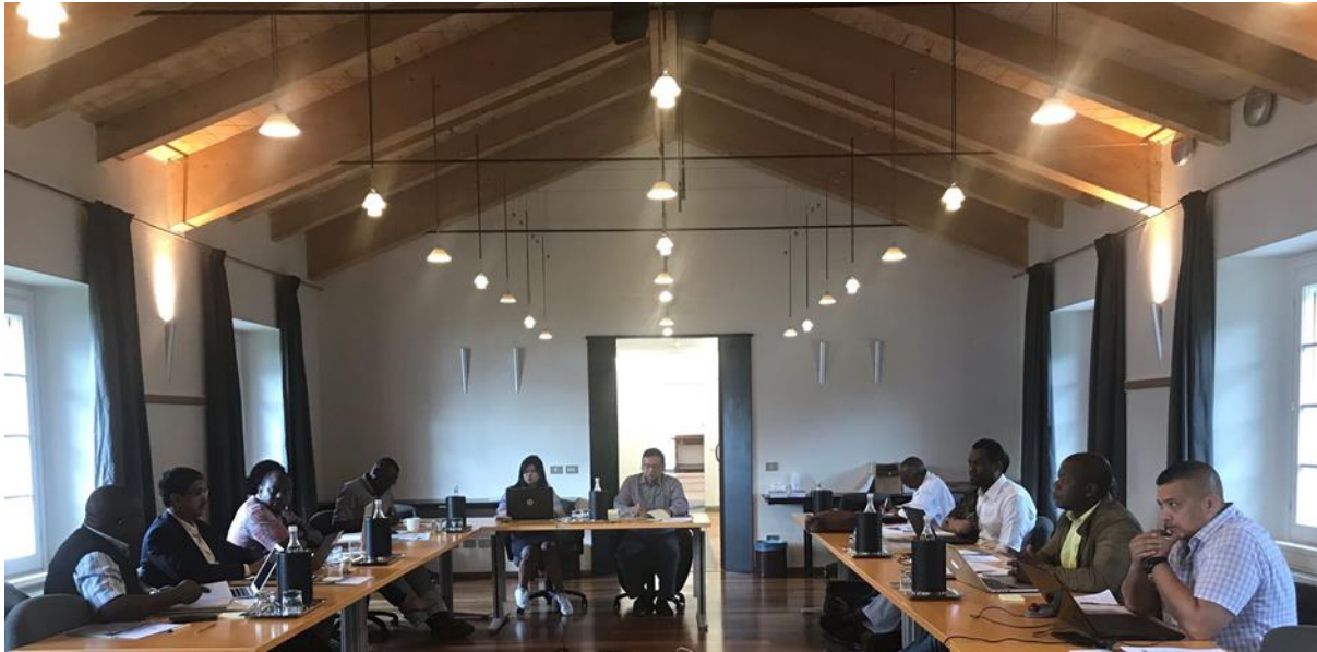
Photo: LUCCC Members and Partners during Plenary Session on the First Day

The second day of the formal plenary sessions carried on the thematic talks from Day One, while also laid emphasis on identification of potential fundraising opportunities (detail in section 6); disaggregation of prevailing opportunities at the national level, then regional level, then across LUCCC; and conversation on prospective synergies between LUCCC and the invited partner institutes that included IIED, WRI, GGGI and UNEP (detail in section 7). The thematic areas on Climate Change Diplomacy, Community-based Adaptation (CbA)/ Eco-system-based Adaptation (EbA) were discussed. On the Climate Change diplomacy front, while Nepal as the theme leader has been undertaking capacity-building efforts to enhance skill of their students to support in-country aspiring negotiators, other LUCCC members are also devising plans to initiate youth programme on Climate Change Diplomacy through training workshops and other tailor-made programmes. Uganda is responsible for producing a repository on CbA and EbA case studies from across LDCs to publish a document by COP 25. In order to facilitate intimate discussions among participants, the discussions on this day was followed by a boat tour in Lake Como and a Dinner Event organized by the Rockefeller Foundation to introduce the conference participants with recipients of the Residency Program in Villa Serbelloni.