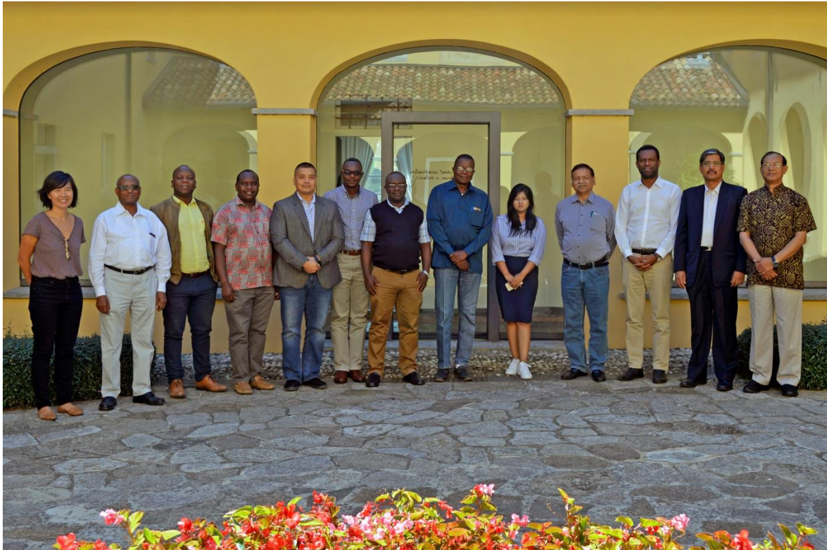
Photo: The participants of the LUCCC Planning Meeting on Day-One