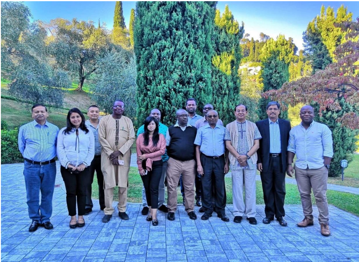
Photo: The LUCCC Planning Meeting Team with Partners on Closing Day

UNEP has long supported LUCCC participation in Gobeshona Conferences in last few years. Also, their recent support to send a five-member delegation team from LUCCC to visit Myanmar has greatly helped engagement of the consortium with the universities there. The delegation with support from UNEP and the government of Myanmar has convened a workshop to integrate Climate Change into University Curricula in Myanmar in light of the on-going efforts in the LUCCC countries.