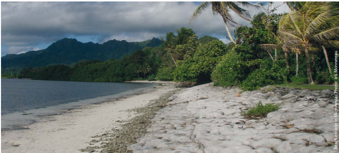
Beach erosion in Micronesia