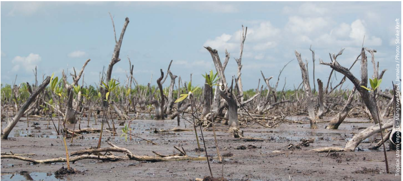
Tropical storm impacts – Mangrove forest, Jamaica

Sea level rise and weather extremes have disastrous consequences for nature and people: SIDS and LDC call for a response of the international community.